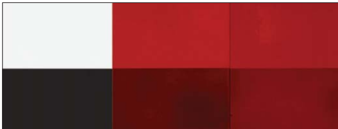
Unpainted Test Card Standard Industrial Würth Spray Paint

It's easy to see how much better Würth Spray Paint performs – just look at the hiding cards below: