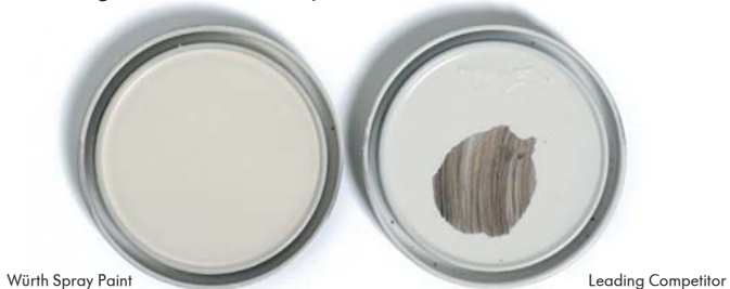
Würth Spray Paint Leading Competitor

Würth Spray Paint will not be affected by gasoline. The panels below were allowed to dry, dripped with gasoline and then wiped off: