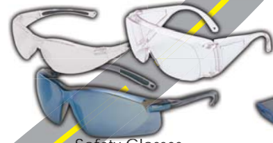
Safety Glasses Prefix 899