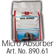
Micro Absorber Art. No. 890.61