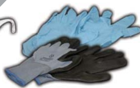
Hand Protection Prefix 899