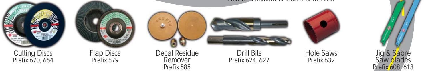
Cutting Discs Prefix 670, 664