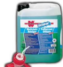
Universal Workshop Cleaner Art. No. 893.124